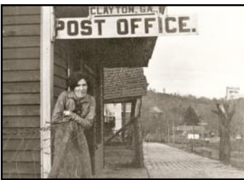
Unknown woman shivers in front of Clayton post office, 1925.