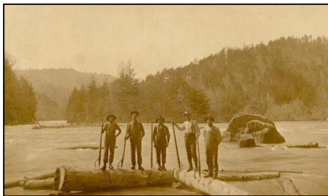
Floating logs down the Chattooga River in 1910

This special exhibit is in addition to the hundreds of historic photos in the Photo Gallery.