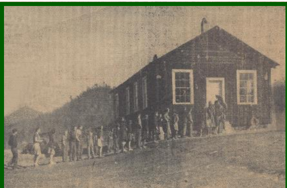
Lining up for lunch at the Persimmon School, 1942

From 1935 through 1942, the WPA assisted in serving more than 371,000 school lunches in Rabun County and the school lunch program did continue even after the WPA was dismantled. Hungry children still exist, of course, but nutritious breakfasts and lunches at school are still helping to fill the need.