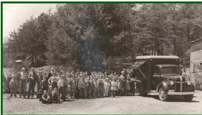
Rabun County Library Bookmobile - Photo, circa 1950

In July of 1938, a Ford panel truck was purchased to carry books out into the county. It was like a vegetable truck with sides that lifted up to reveal the books. The bookmobile driver was also paid with WPA funding. The bookstock and circulation continued to increase, and the overwhelming majority of the circulation was through the bookmobile. In 1942 circulation was 79,352; 64,067 of these books were