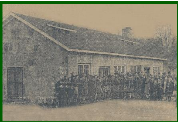
Clayton School students line up for lunch at the Cannery Building, 1942