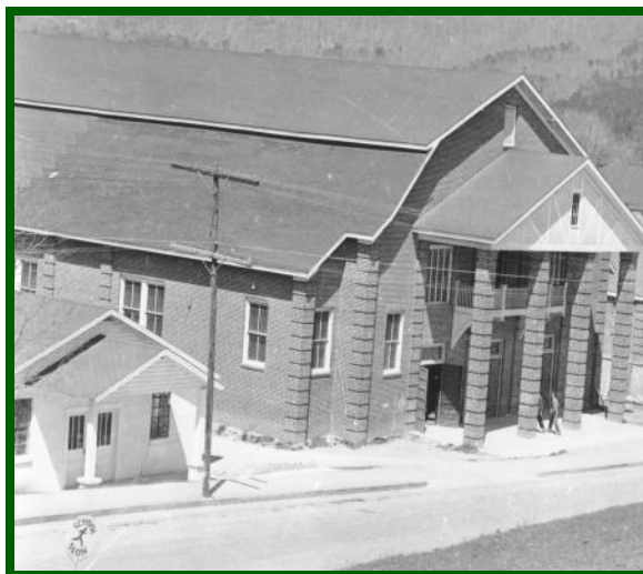
Rabun County Library building next to the gym (now Civic Center) - Photo, circa 1960

checked out from the bookmobile. Circulation of library books in Rabun County was reported to be three times the national average. This was more than ten books for every person in the county. One mountain reader said Rabun County people had a reputation for being "the book-readingest folks in or out of the Blue Ridge mountains."