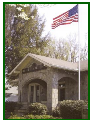
Contemporary photo of the Rock House, which was built in 1935.

When the WPA was phased out in 1943, Rabun County had the WPA to thank for fifty miles of new roads, seventeen new bridges, a new bookmobile, 760 persons taught to read and write, thousands of garments sewn, and 371,000 hot school lunches served. The Clayton Tribune reported in December of 1941 that “this program has been one of the largest factors in the well-being of the county... It was designed to give employment to jobless people, but the benefits are permanent and will be a credit to the county for many years to come.” This prediction