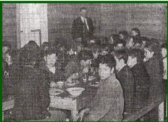
Lunch at the Mountain City School, 1942