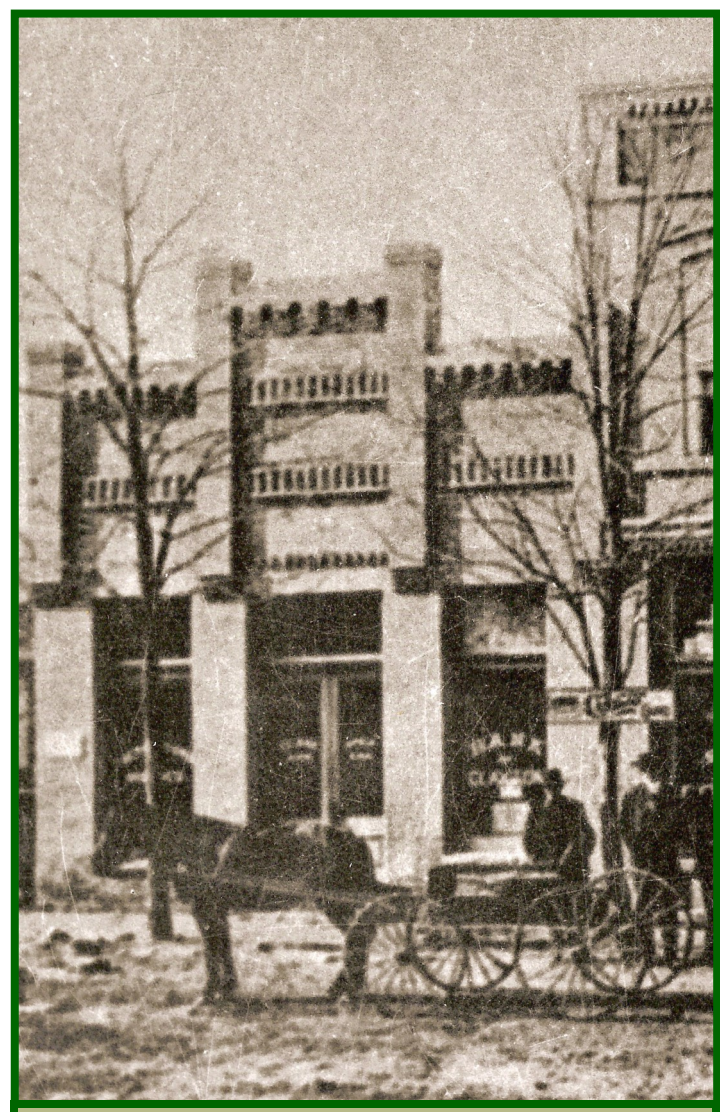
The Bank of Clayton on South Main was organized in 1904 as Rabun County's first bank and the only bank for many decades.