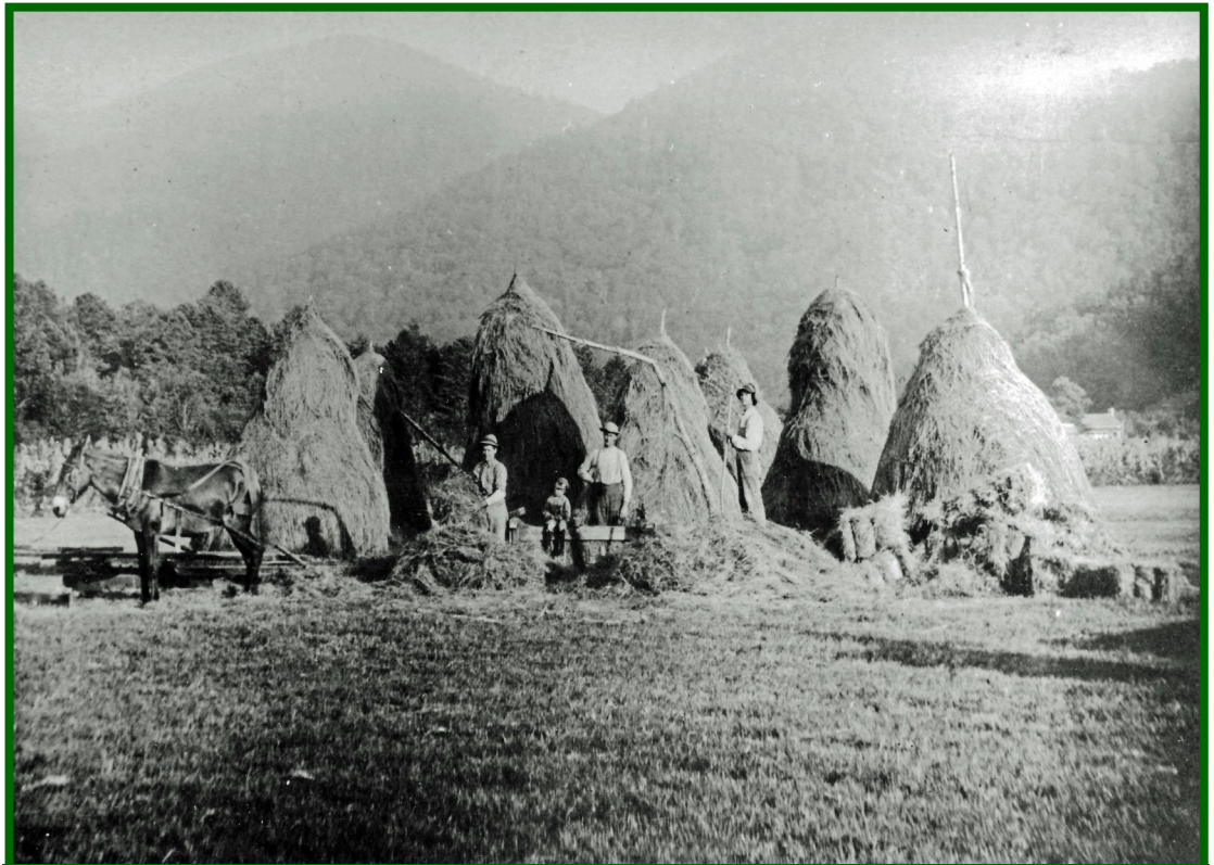
Gathering hay at the York House in Rabun Gap, 1890s.