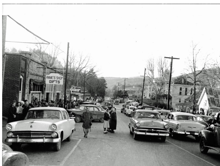
West Savannah Street in the 1950s - looking west toward the courthouse.