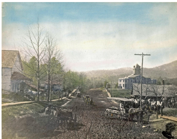
West Savannah Street in February 1909 - a muddy road looking west toward the courthouse.

Savannah Street has also seen many changes. Originally named Courthouse Street, it was renamed shortly after the Bleckley House hotel, operated by Savannah Bleckley, was moved to the end of the street.