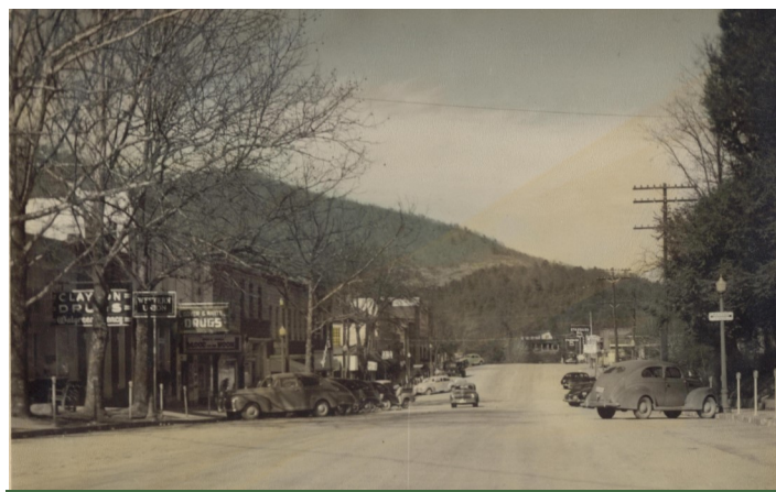
Main Street in 1948