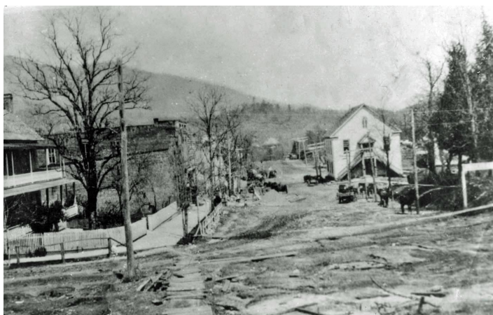
The Rabun County Courthouse was in the town square on Main Street. It was built in 1880 and moved in 1908.

Clayton's Main Street has seen a lot of progress since it was first photographed in the early twentieth century. As changes continue, in this issue of the Quarterly , we are highlighting photos from various decades. They were all made from South Main, looking north, with Black Rock Mountain always in the background.