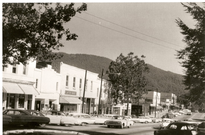
Main Street in the mid-1960s