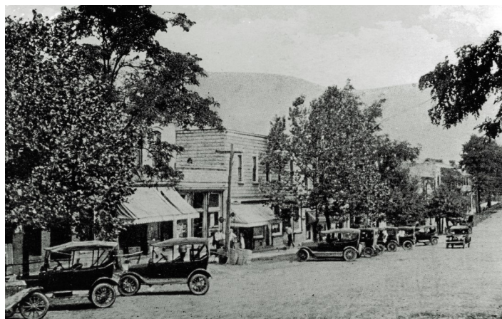
We are dating this photo in the 1920s due to the abundance of Model T Fords. Main Street was paved in the 1920s, though this appears to still be unpaved.