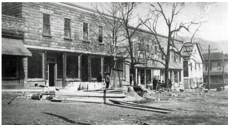
South Main Street in 1912 showing construction of buildings in what was then called the Derrick Block, now referred to as the Reeves Block

Savannah Street has also seen many changes. Originally named Courthouse Street, it was renamed shortly after the Bleckley House hotel, operated by Savannah Bleckley, was moved to the end of the street.