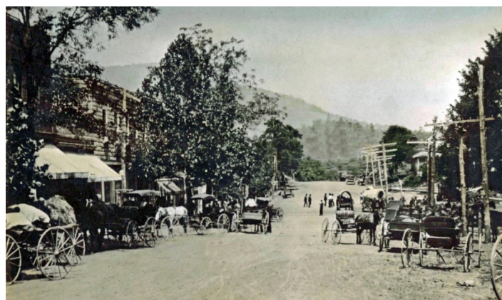
This circa 1915 photo shows the courthouse building has been moved. In addition to the telegraph poles lining the street, there are the electric poles erected by Thomas Roane in 1914 to provide power to more than 50 homes and businesses in Clayton.